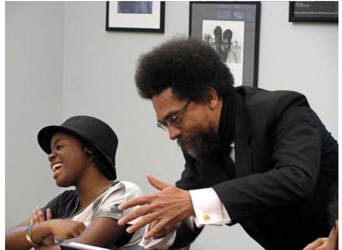
SisterMentors 12th Grader with Professor Cornel West

Then the most extraordinary thing happened — one of the girls gave Professor West a poem from one of her friends who is a big Cornel West fan. He read the poem and then invited all of the girls into his office to call the poet. All the girls piled into his office where he read the poem aloud on the phone. It was quite an experience. His office is like a museum with lots of displayed books and photos of him with celebrities.