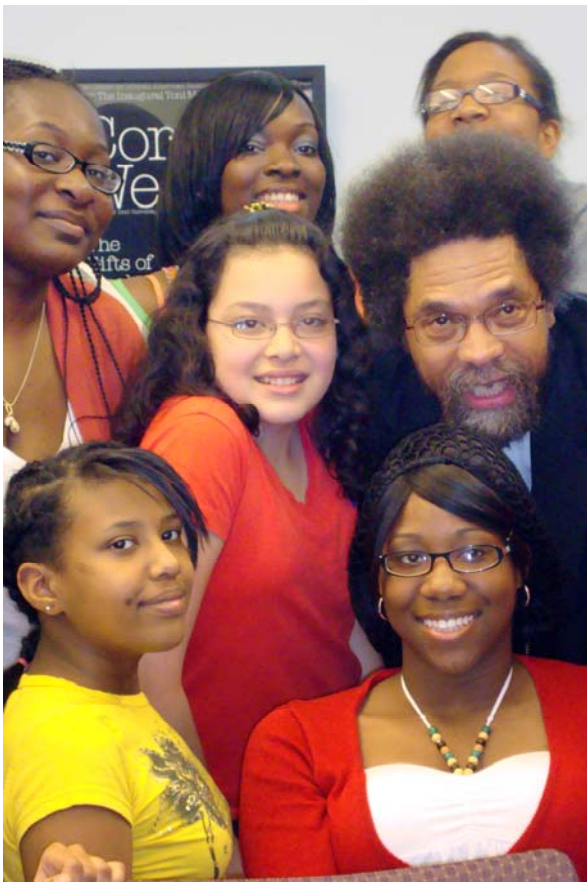
SisterMentors Girls with Professor Cornel West