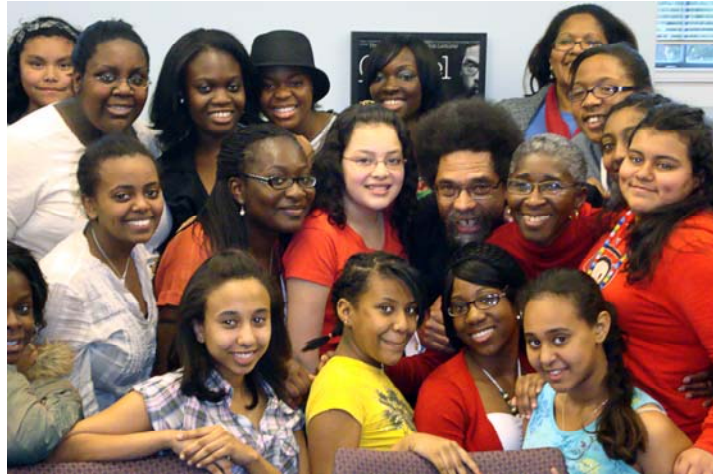
At Princeton University with Professor Cornel West

Located in Princeton, New Jersey, Princeton University is one of the most selective schools in the United States. Its renowned faculty includes Professor Cornel West, one of the