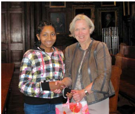
SisterMentors 7th Grader with President Shirley Tilghman

When we returned home, one of the girls told her mother that she felt as though she was “in a castle.” Indeed, the campus is quite beautiful with buildings that are castle-like.